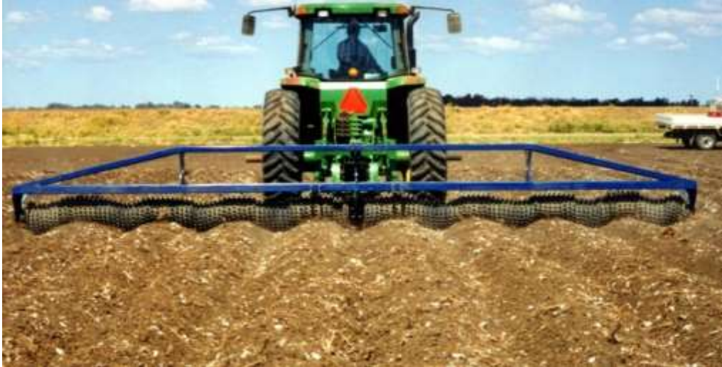
The Contour Following Ability is Ideal for Raised Beds.

The Flexi Roller rings are allowed to work up and down in a vertical plane enabling individual contour following. Best results will occur if the entire weight of the machine is rested on the roller rings. Therefore if hydraulic or manual transport kits are fitted the wheels should be raised clear and as high as possible.