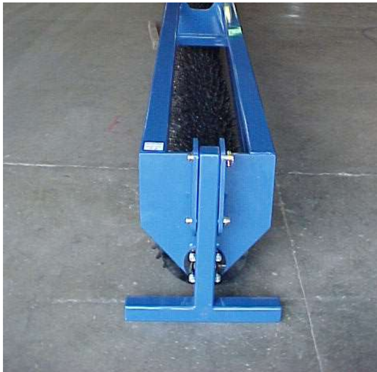
Support Stand on Three Point Linkage Models