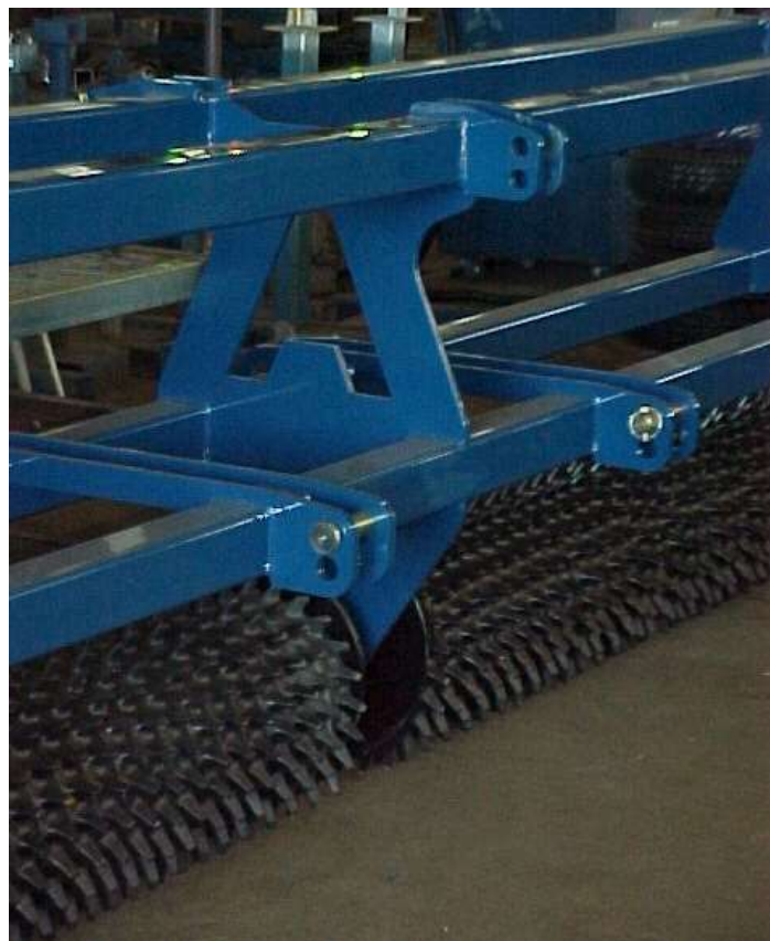
Cat III Three Point Hitch

Cat III Three Point Linkage Cat IV Three Point Linkage